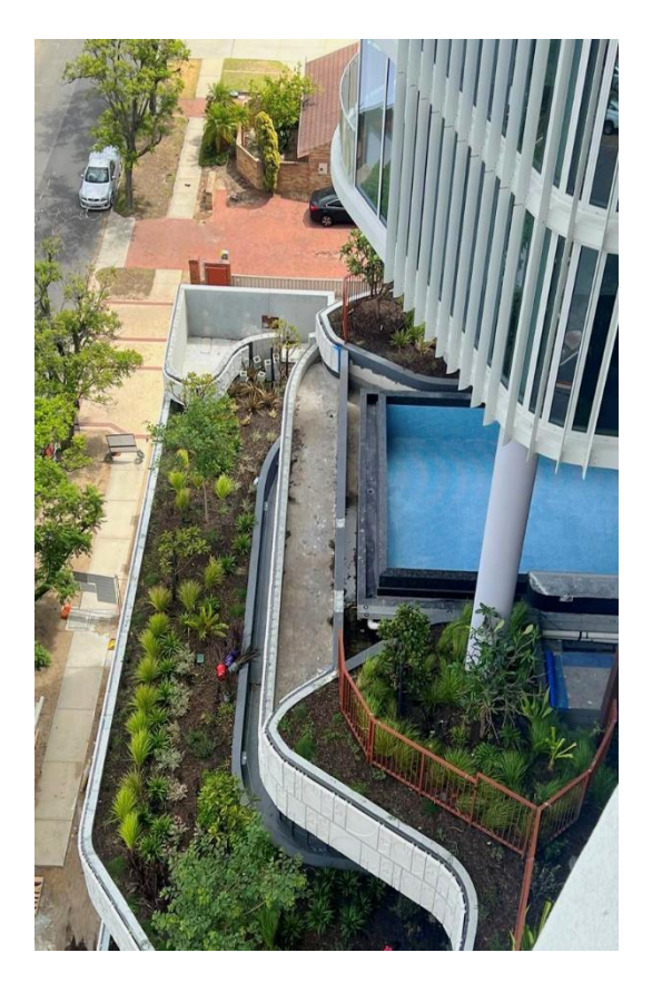
Amenity level and communal gardens

In addition to the finishing construction activities, the Company continued with its sales and marketing campaign for the Project. An additional $2.3m in sales were achieved during the Quarter for the Project. To date, 91% of the apartments have been sold. Negotiations are continuing in relation to the lease and/or sale of the commercial area on the lower levels. Survey works have also commenced on site in preparation for lodging for titles once complete.